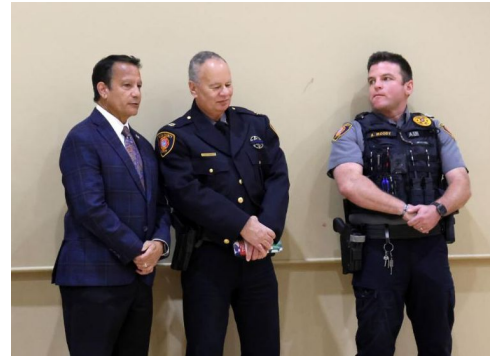
The Tulsa County Sheriff's Office held a memorial service for the 13 deputies who lost their lives in the line of duty since 1909.