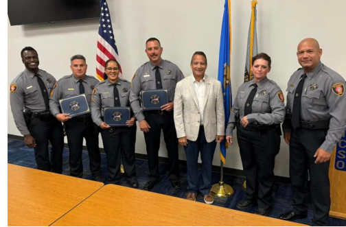
The Commissioner was honored to attend the promotion and new deputies ceremony at the Sheriff's Office in June.