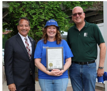
Tulsa County and the M.e.t. presented ONEOK with a proclamation at the Enviro Expo Day in April. The event had lots of great educational booths and activities.